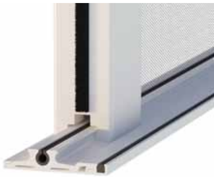
■ Bottom Track 12.5mm