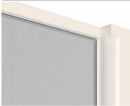
■ Concealed Fixings