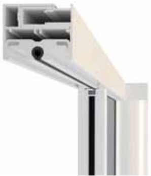
■ Top Track